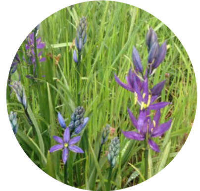
Above Camas flowers

Today, steps are being taken towards greater awareness and respect of First Nations interests in the island region—both past and present. The Islands Trust Conservancy, like many other agencies, is working to better engage with local First Nations and is seeking opportunities to integrate traditional knowledge, identify and protect culturally significant species, improve stewardship of cultural and natural heritage, and appropriately recognize Aboriginal Rights and Title, and Treaty rights.