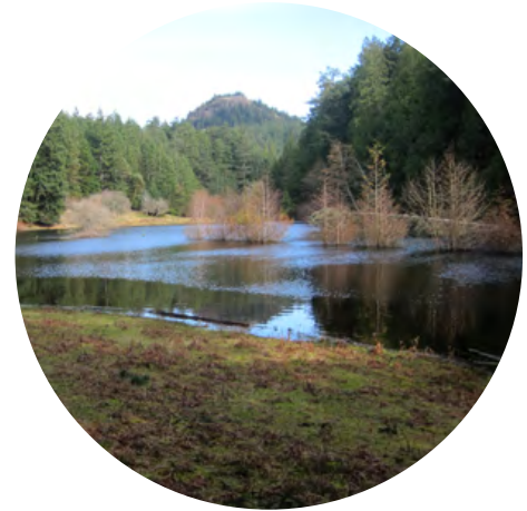
Above John Osland Nature Reserve, Lasqueti Island Below Volunteers from the Lasqueti Island Nature Conservancy clean up garbage from Kwel Nature Reserve