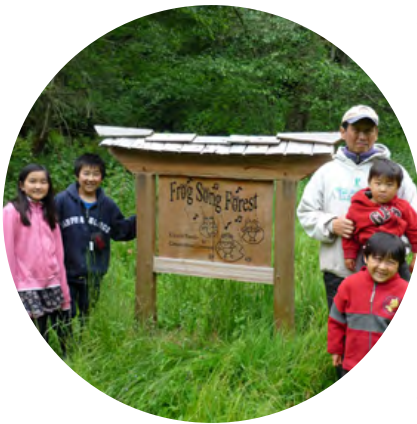
Above The Kikuchi family at Frog Song Forest