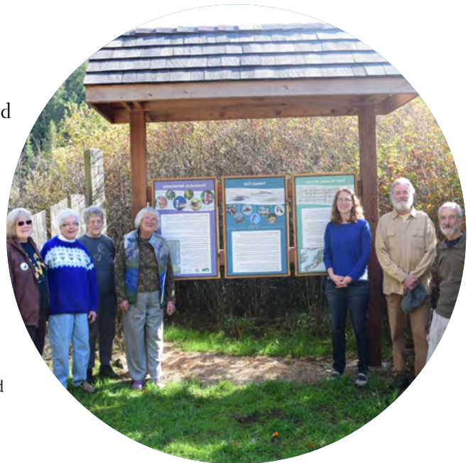
Above, right Douglas-Fir standing tall over Valens Brook Nature Reserve, Denman Island Below, right Interpretive sign at Medicine Beach Nature Sanctuary, North Pender Island